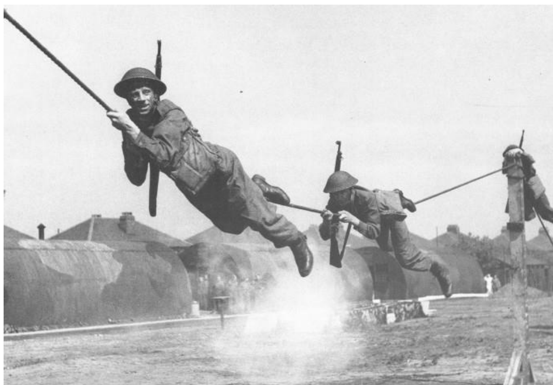
Home Guard training exercises