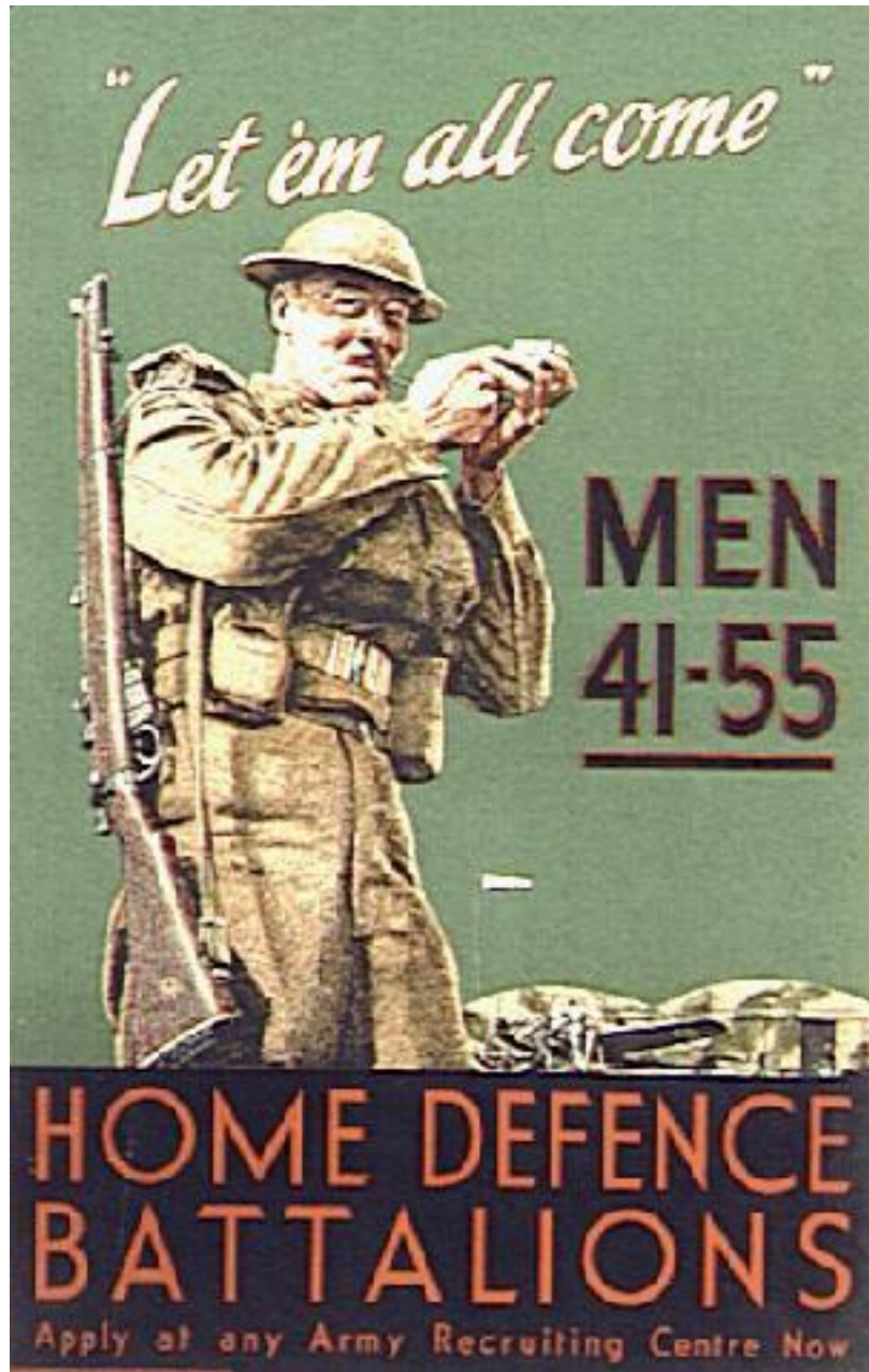
A poster asking men to join the Home Guard.