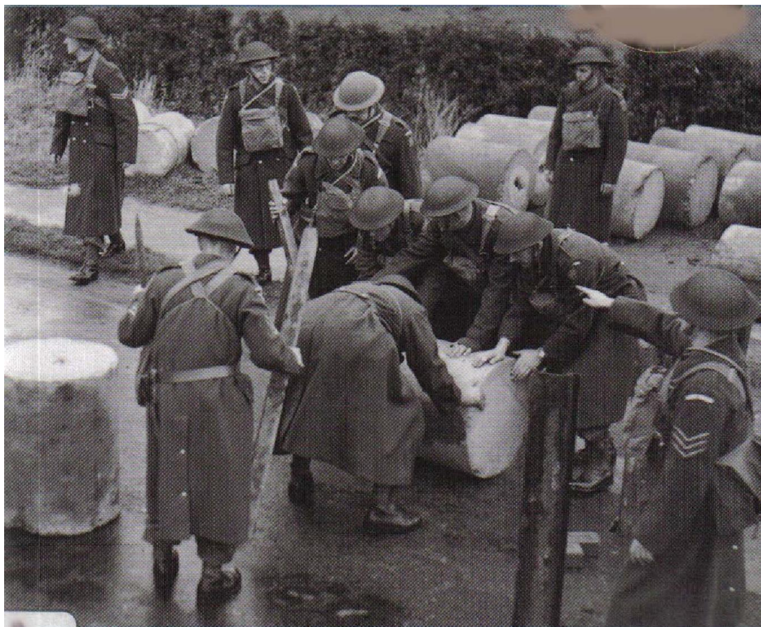
Home Guard road block.