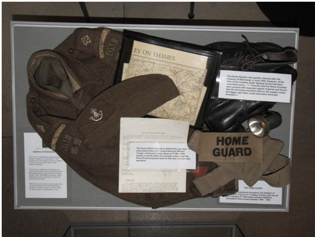
Home Guard uniform