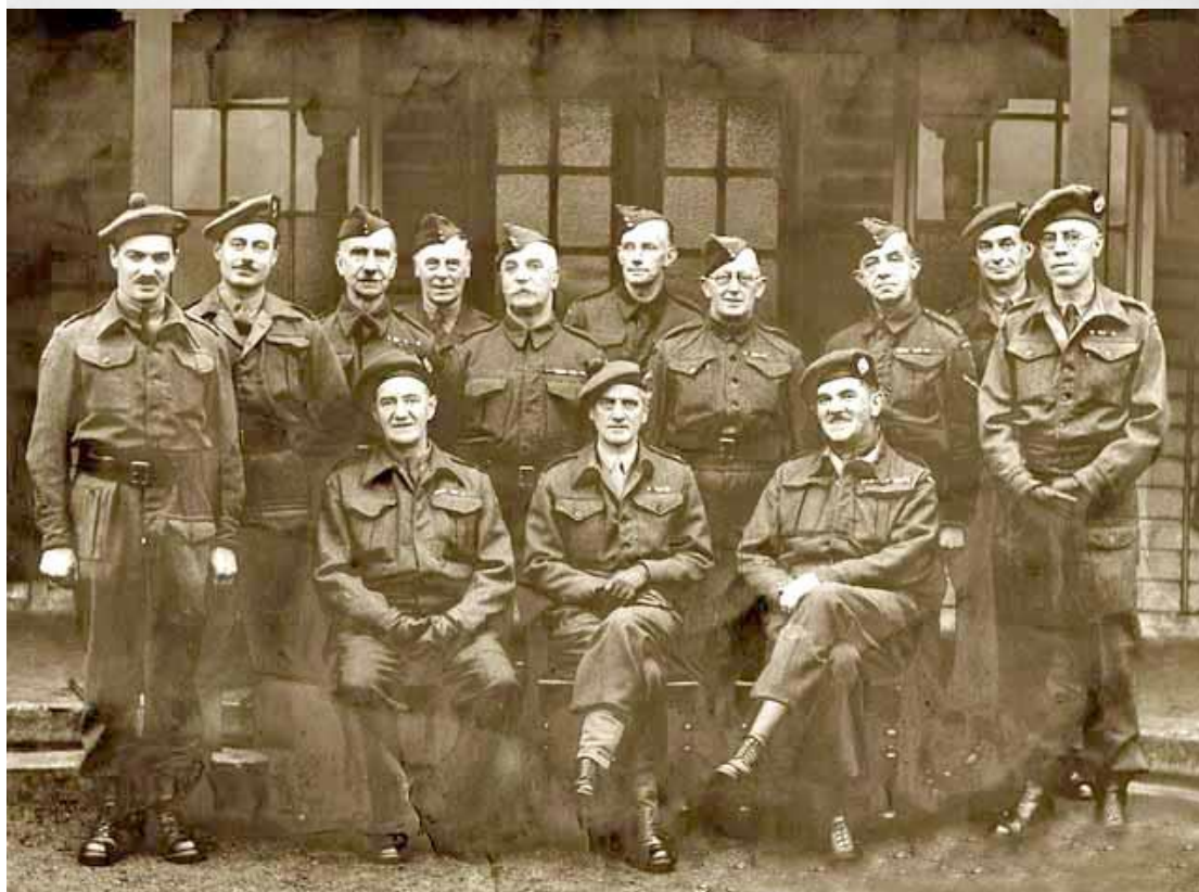
Uniforms in 1940 and 1944