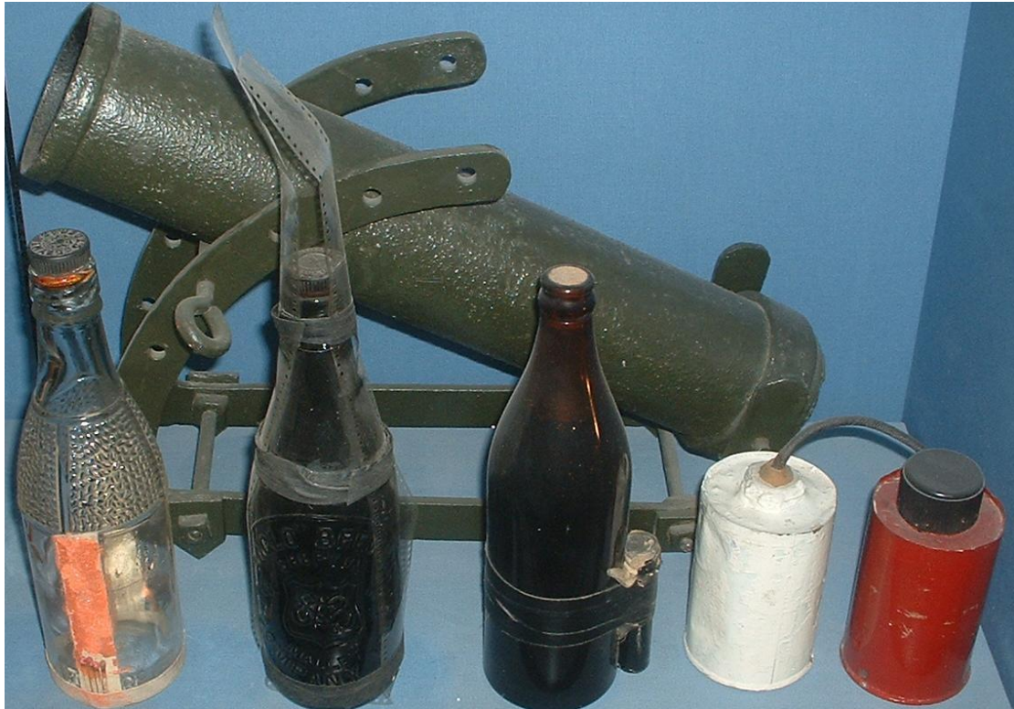
Some of the strange weapons invented by the Home Guard, including Home Made bombs and a launcher.