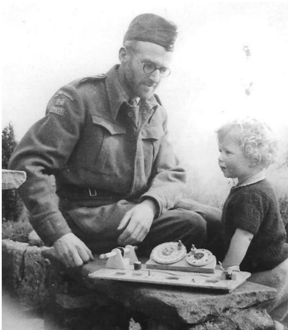
A Home Guard member in a 1942 'Battledress uniform'