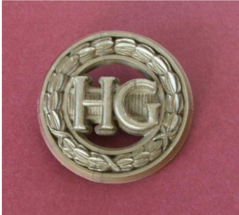
A plastic badge issued to women from the Women's Home Guard Auxiliary force later in the war.