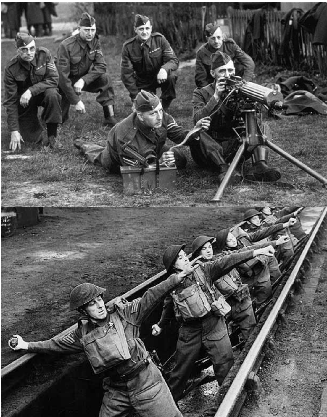
Home Guard training exercises